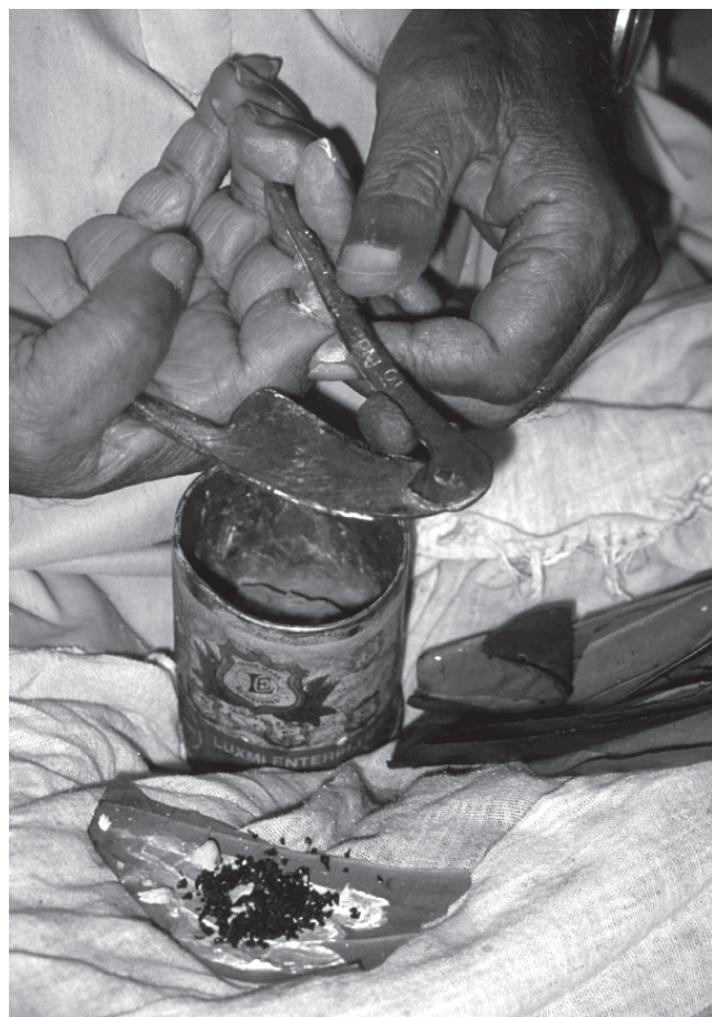
SWAMI slices the areca nut ( Areca catechu ) for his betel chew.

Next, SWAMI applies a coating of slaked lime to the leaf, a practice that is common to almost all betel preparations. Slaked lime is lime ( \text{CaO} ) that has absorbed water to produce calcium hydroxide ( \text{Ca(OH)}_2 ), a more alkaline form of lime. The slaked lime reacts in the quid with the chemical arecoline from the areca nut to produce arecaidine, a stimulant to the central nervous system with nicotine-like properties (RUDGLEY 1993, in BEE 2000). The slaked lime also irritates the membranes of the cheek, increasing blood flow to the area, which aids in the absorption of the tropane alkaloids contained in Datura (McCLOY 2002).